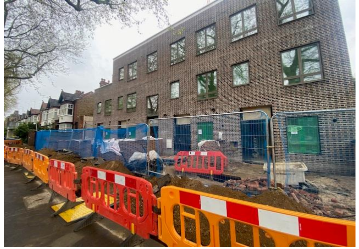
Fig 5: External Building