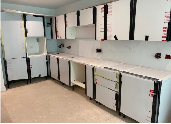
Fig 3: Internal kitchen units